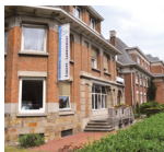
Medical Centre EUROPE - LAMBERMONT Rue des Pensées, 1- 5 1030 Brussels