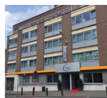
BASILIQUE Clinic Rue Pangaert, 37 - 47 1083 Brussels