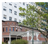
Site ST-ANNE ST-REMI Boulevard Jules Graindor, 66 1070 Brussels