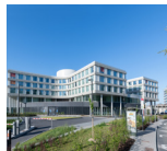
Site DELTA Boulevard du Triomphe, 201 1160 Brussels