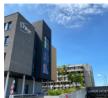
Site BRAINE-L'ALLEUD - WATERLOO Rue Wayez, 35 1420 Braine-l'Alleud