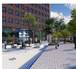
Medical Centre PARK LEOPOLD Rue du Trône, 100 1050 Bruxelles