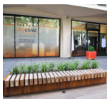
CITYCLINIC CHIREC Louise Avenue Louise, 235B 1050 Brussels